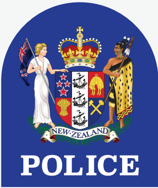
NZ Police Coat of Arms