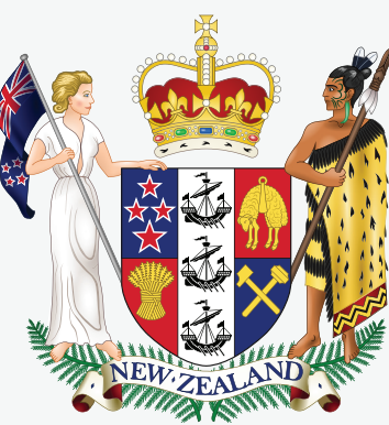
New Zealand Coat of Arms