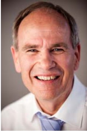
Len Brown Mayor of Auckland

The New Zealand Communities Football Cup is an event that I am very happy to be able to welcome you to, as Mayor of the new Auckland.