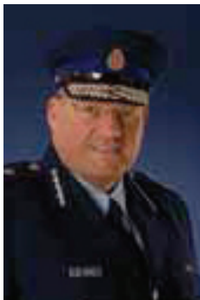
Howard Broad Police Commissioner

The New Zealand Police are proud to present the third national ethnic soccer tournament, the New Zealand Communities Football Cup, here in Christchurch.